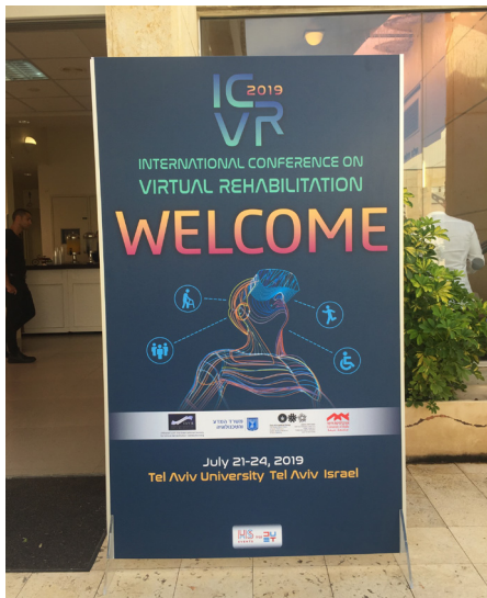
Welcome ICVR 2019