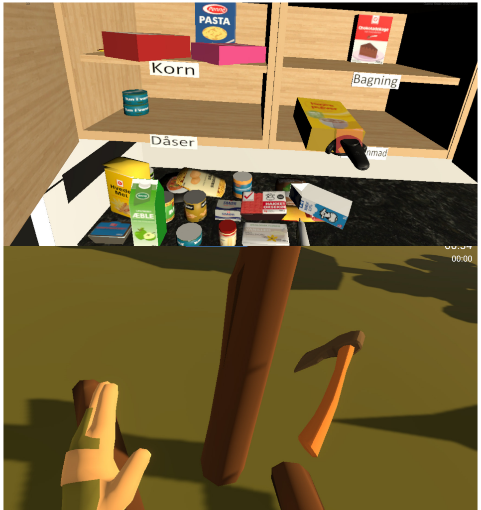
VR-Rehab has several immersive environments in which the rehabilitation of activities of daily living can be performed.

We experience a growing interest in VR and its use within healthcare and rehabilitation. Many of our visitors come to learn more about VR and experience it themselves. Most of the healthcare professionals and rehabilitation specialists who try VR are positive and agree that VR holds a large potential for creating meaningful and motivating rehabilitation exercises. Many health professions appreciate the opportunities for tracking their patients' progress and creating environments and challenges, which fit the individual patient. Based on experience with the previously mentioned systems, we can also see that VR, as a tool, can be used in various rehabilitation settings and not just within physical rehabilitation. These include rehabilitation of anxiety disorders and cognitive abilities.